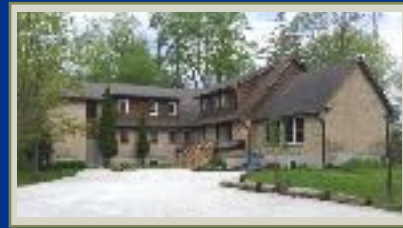
Morrow Hall, Men's Residence

Commencement: A monthly ceremony for graduating residents to celebrate in the company of family, friends, fellow residents and Stonehenge staff.