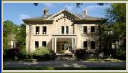
Dougan Hall, Men's Residence

Stonehenge Therapeutic Community is a long-term intensive treatment program for men and women whose lives have been devastated by alcohol and drug abuse and whose reality includes the fractured relationships, derailed careers and encounters with the legal system that so often result. Many of our residents are veterans of other, less intensive programs - none of which have produced long-lasting results.