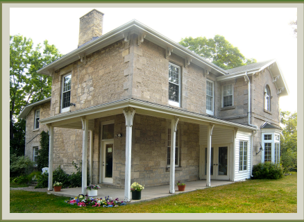
Century Home, Women's Residence

Commencement: A monthly ceremony for graduating residents to celebrate in the company of family, friends, fellow residents and Stonehenge staff.