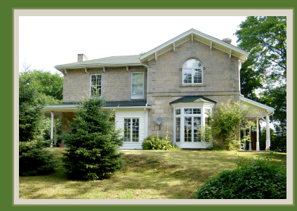
Century Home, Women's Residence

Stonehenge Therapeutic Community is a long-term intensive treatment program for men and women whose lives have been devastated by alcohol and drug abuse and whose reality includes the fractured relationships, derailed careers and encounters with the legal system that so often result. Many of our residents are veterans of other, less intensive programs none of which have produced long-lasting results.